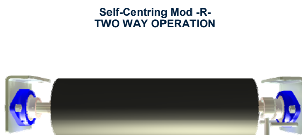
Self-Centring Mod -R- TWO WAY OPERATION