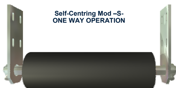
Self-Centring Mod -S- ONE WAY OPERATION